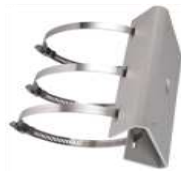
DS-1275ZJ-SUS Vertical Pole Mount