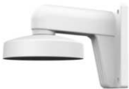
DS-1273ZJ-140 Wall Mount